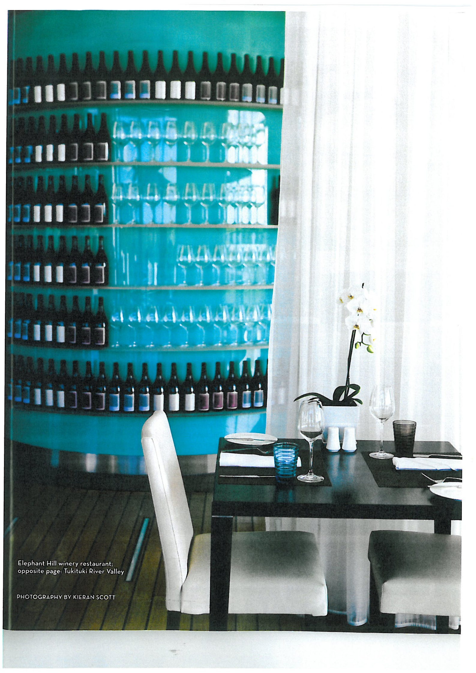
Elephant Hill winery restaurant; opposite page: Tukituki River Valley